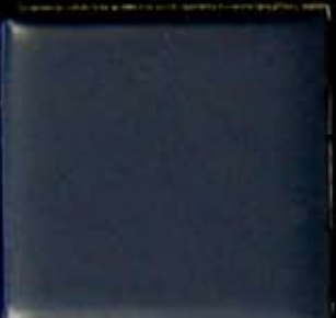
midnight blue QH57 2