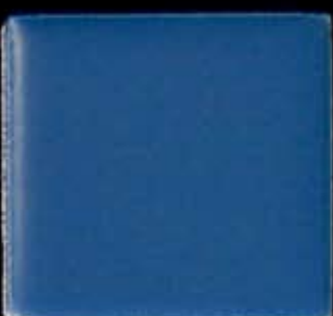
atlantis QH43 2