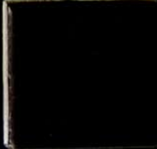
black QH45 1