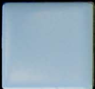
iceberg QH82 1