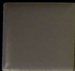
cinder QH08 1