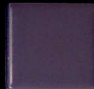
grape QH54 2