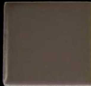
steel QH21 1