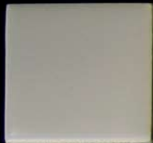
mist QH15 1