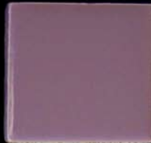
wisteria QH70 2