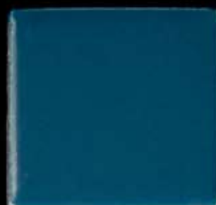
real teal QH66 2