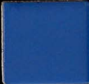
periwinkle QH31 1