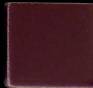
eggplant QH51 2