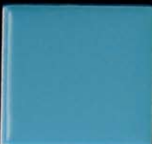
aegean QH41 1