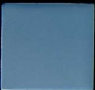
starlight QH68 1