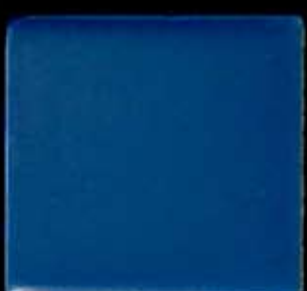
pacific QH61 2