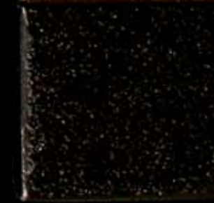
black QH45 with abrasive 1