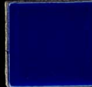
regency blue QH67 (for walls only) 2