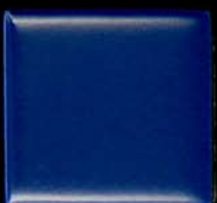
blueberry QH46 2