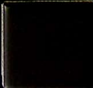
raven QH65 (for walls only) 2