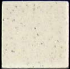
mica pinpoint QH81