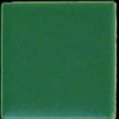
spring green QH29